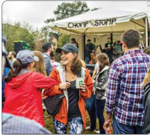
The party that was. Chomp and Stomp 2015.

Hello fellow Cabbagetowners, neighbors, businesses, and those just passing through! The 14 th Annual Chomp & Stomp Chili Cookoff and Bluegrass Festival is just a couple months away, can you believe it?