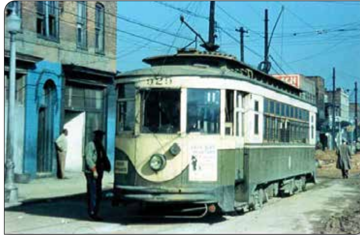
An Atlanta street car during the 1940s

During the first half of the last century, trolley cars and streetcars used to wind their way through Cabbagetown and Kirkwood to Agnes Scott College in Decatur on what was formerly the Atlanta-Decatur Trolley Line. That all ended once the automobile took a strange hold on the Atlanta psyché and city planners.