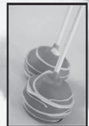
Cruffles (Cake Pops)

Bring this newsletter in for 10% off your entire purchase during the month of February