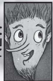
Willy's WHEATGRASS Juice! mixed with organic pear, apple or orange