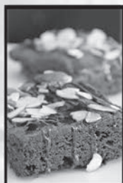
Gluten Free Brownie

Deadline for Valentine's Day Delivery Orders: 2/12