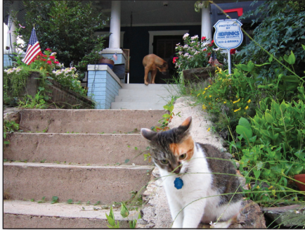
Hound dogs, a cat and a home security system stand guard at a home on Kirkwood Avenue.