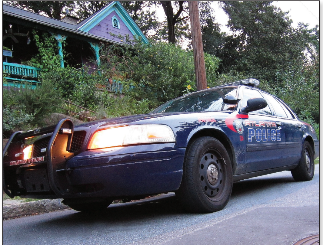
The Atlanta Police Department patrolling Tye Street. APD has stepped up its presence throughout Cabbagetown.

The Community Center is located at 177 Estoria Street. If you have an item to add to the agenda, please email cniaboard@gmail.com .