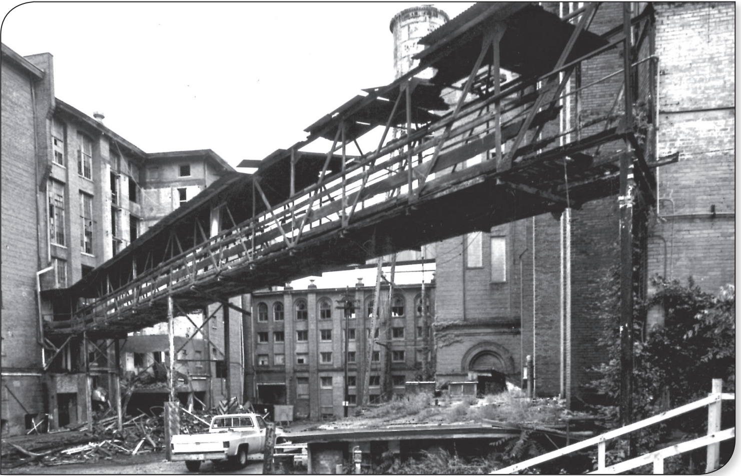
Above: The Fulton Cotton Mill in 1996.