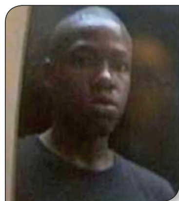
Surveillance photo of the July 3 rd home invasion and kidnapping suspect. Later turned into police by his parents.

who would be alerted and then alert their neighbors to suspicious activities or current crime issues through a phone system. We are also looking into electronic methods of alert systems which are used by various neighborhoods. There are advantages and disadvantages to both - so we are evaluating the best method for us, which may be a combination solution.