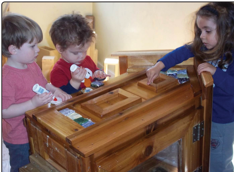
The two-year-old class at GPCP put the finishing touches on a "Little Free Library".

Little Free Libraries are hand-crafted wooden boxes placed in public spaces and stocked with free books. Cabbageheads are welcomed to "check-out" a book or donate a book anytime.