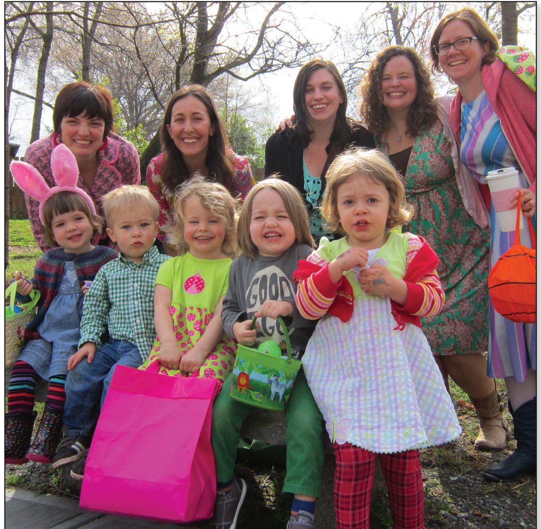
The Easter Bunny hid treats at Cabbagetown Park and some of our littlest neighbors found them all!

The Community Center is located at 177 Estoria Street. If you have an item to add to the agenda, please email cniaboard@gmail.com .