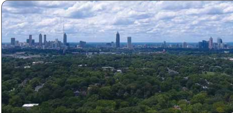
Atlanta in the forest.

Atlanta's tree canopy covers almost half of the city – 47.9 percent – according to an assessment released in 2014 by the Atlanta Tree