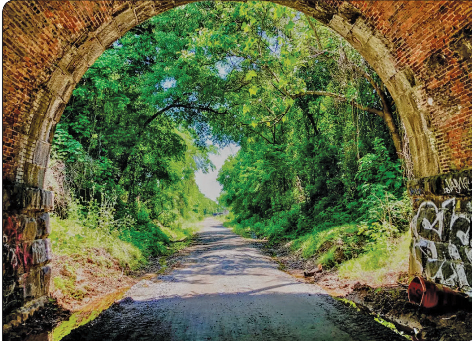
The Southside Trail, May 2019.