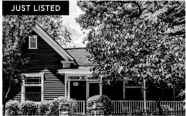
171 Powell Street SE 3 Bed | 2 Bath | Offered for $595,000