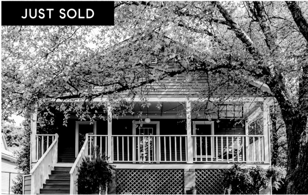
608 Gaskill Street SE 3 Bed | 1 Bath | Sold for $390,000