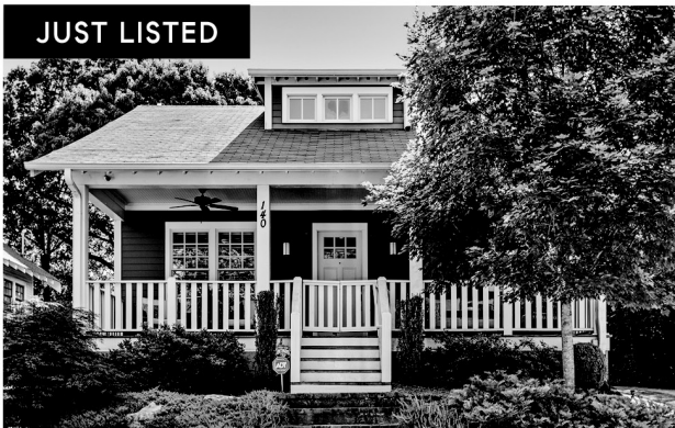
140 Estoria Street SE 4 Bed | 2.5 Bath | Offered for $789,000