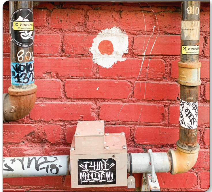
Does this egg look familiar?