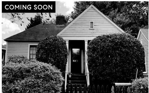
275 Berean Avenue—Investment Opportunity 2 Bed | 1 Bath | Offered for $339,000