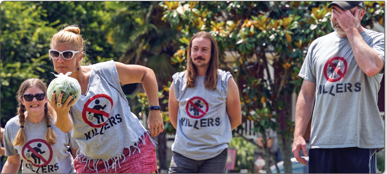
The Gaskill Killers at the Second Annual Cabbagetown Olympics.