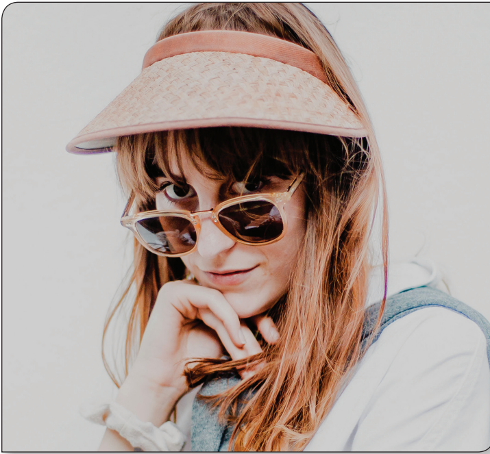
Faye Webster.

Says Pitchfork "The 21-year-old singer-songwriter's third album ( Atlanta Millionaires Club ) is serene folk-pop with a mellow soul tinge and the melancholy clarity of someone twice her age."