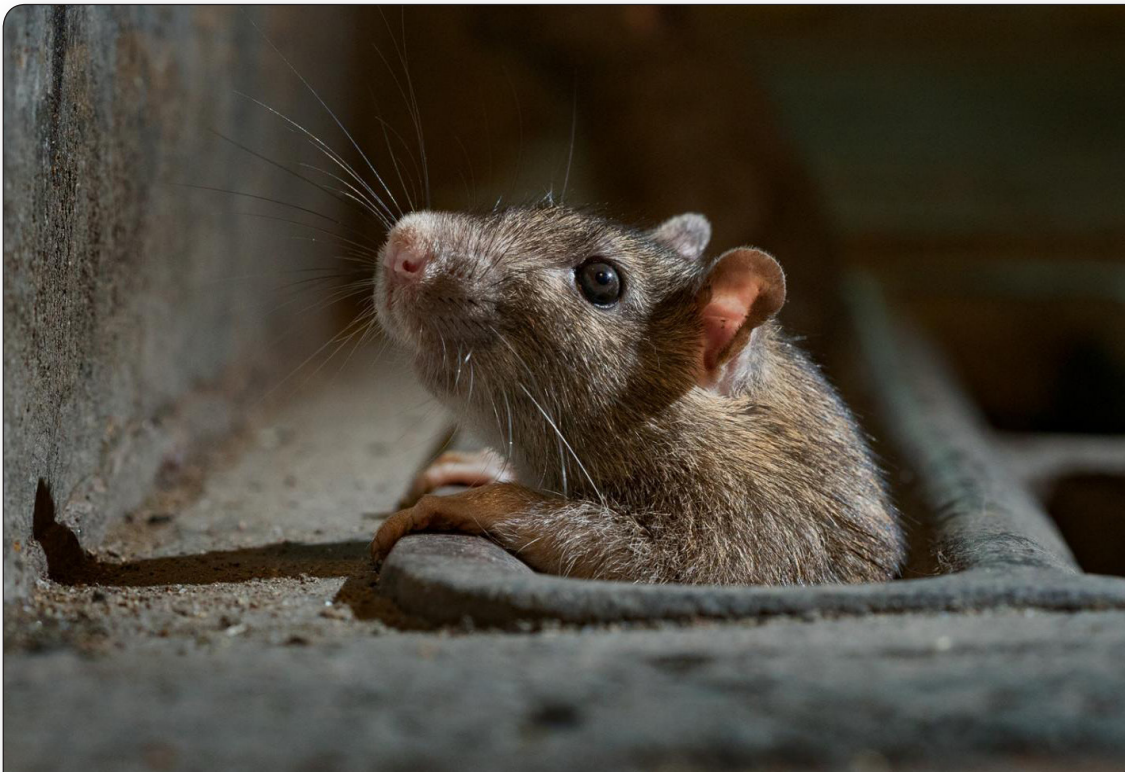
Admit it... you think she's kinda cute, right?

For Oakland Cemetery, we hope they get their long-awaited eastern gateway.