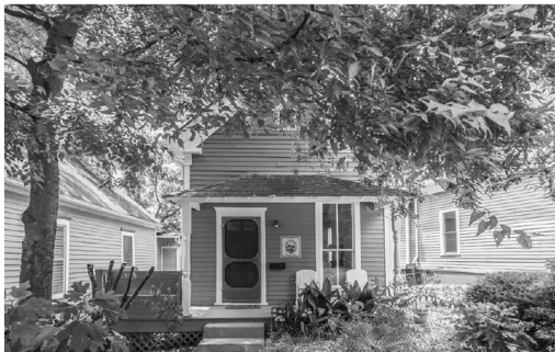
167 Powell Street — Offered for $325,000