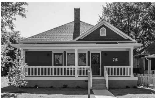
256 Powell Street — Offered for $675,000

chrisie.kallio@compass.com m 404.295.2068 o 404.688.6621 chrisiekallio.com