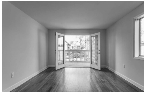
212 Berean Ave #3 — Offered for $259,000