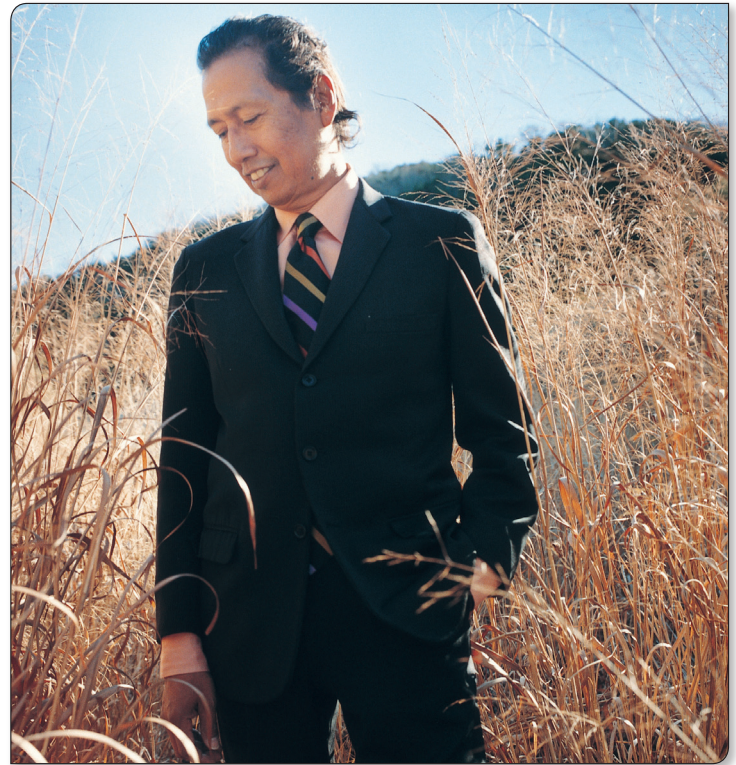
Friday, January 11 th : Alejandro Escovedo @ City Winery

Sun. Jan. 26, Arlo Guthrie @ Buckhead Theater – Celebrating the 50th anniversary of "Alice's Restaurant", Guthrie has never fully carried his father Woody's torch as a political activist, but rather as a curator of contemporary folk music, with some dabbling in the resistance. I was a big fan as a kid (still am) and my Dad took me to see the movie "Alice's Restaurant" when I was about thirteen. I still remember it well – boobs!