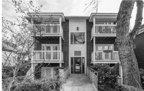
212 Berean Ave #5 — Offered for $259,900