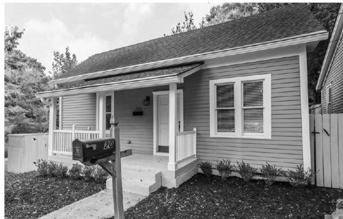
720 Mollie Street — Offered for $2400/Month