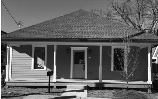
171 Savannah Street — Offered for $610,000