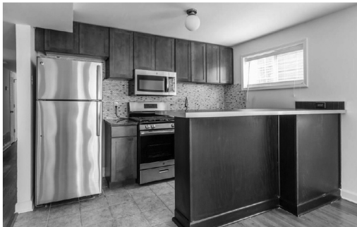
212 Berean Ave #4 — Offered for $279,000