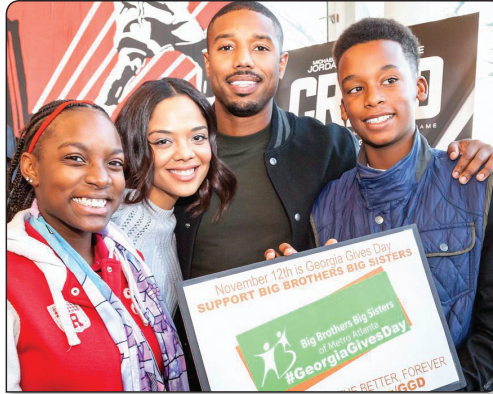
"Creed" Stars Michael B. Jordan & Tessa Thompson Donate $5,000 to Big Brothers Big Sisters Of ATL