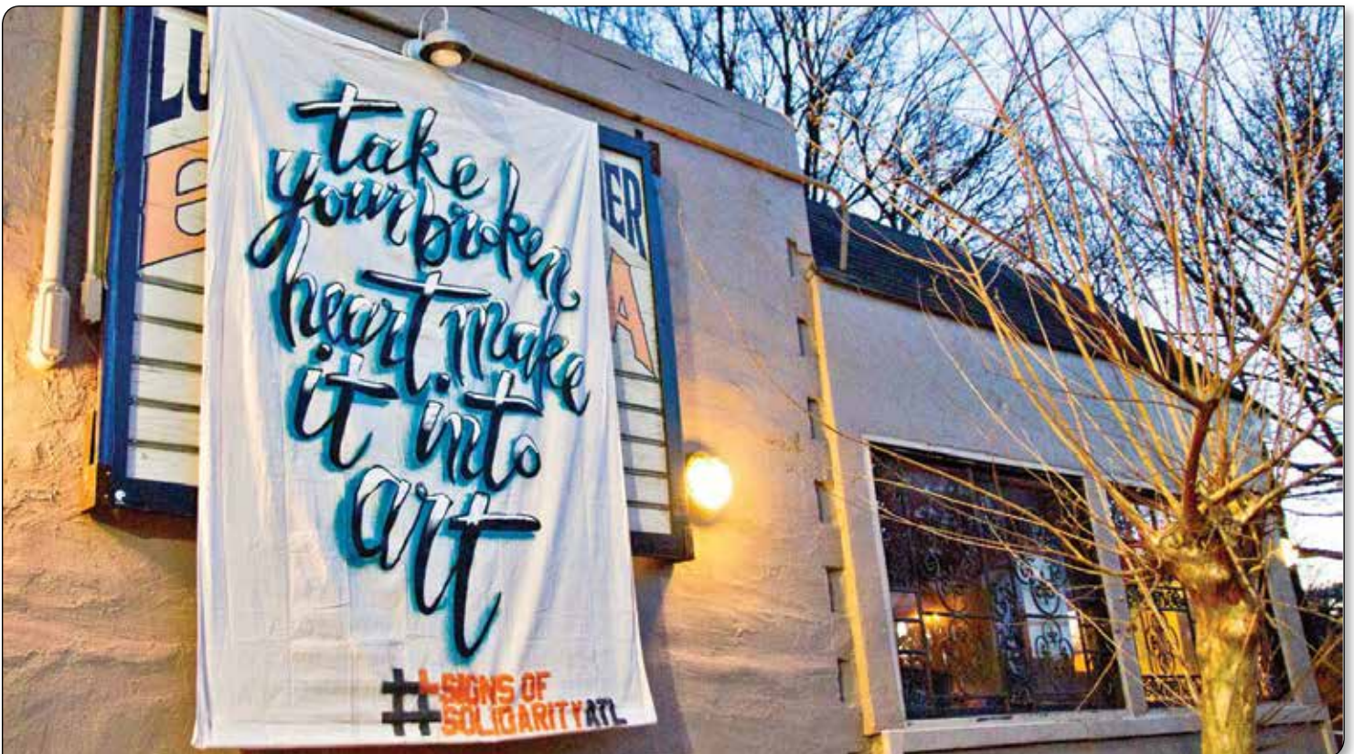
The message at 97 Estoria. Art by Tiger Wizard.