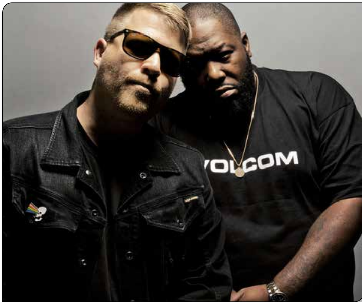
El-P and Killer Mike

Recently they sat down with The New York Times . During the conversation, they spoke a bit about Cabbagetown.