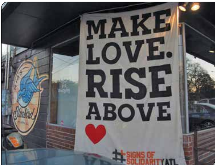
The message at Ria's Bluebird. Art by Soap Goods Creative.