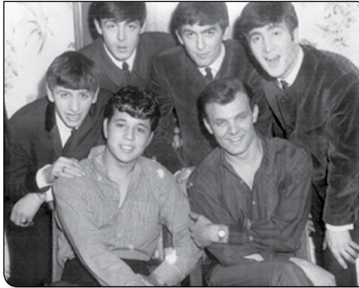
Tommy Roe (bottom right) with The Beatles

Roe said, "My journey from a working class section of Atlanta called Cabbagetown to the glamour that is Hollywood was anything but easy. I stuck by my principles and values making a name for myself