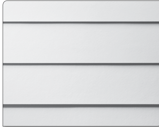
Smooth faced Hardie Plank

The specific text regarding this regulation states: "Wood, smooth-surface cementitious siding or Masonite siding are permitted. Siding shall exhibit a horizontal, clapboard profile. Siding shall have no less than a four-inch reveal and no more than a six-inch reveal."