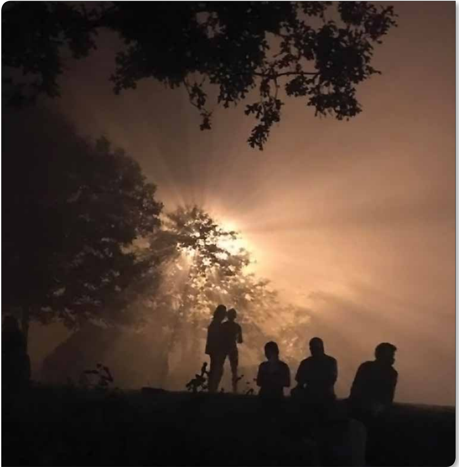
The Fourth of July in Cabbagetown Park, 2017.