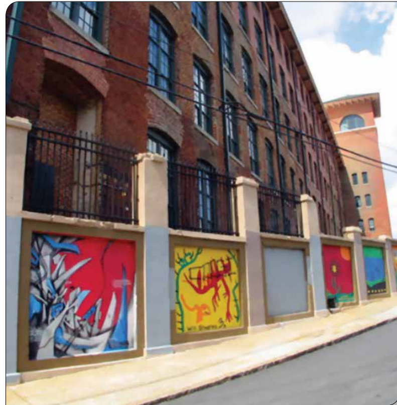
Stacks Square murals as depicted in 2008

Swim, party, and socialize! Meet artist and organizer Austin Blue, plus other participating muralists including special guests.