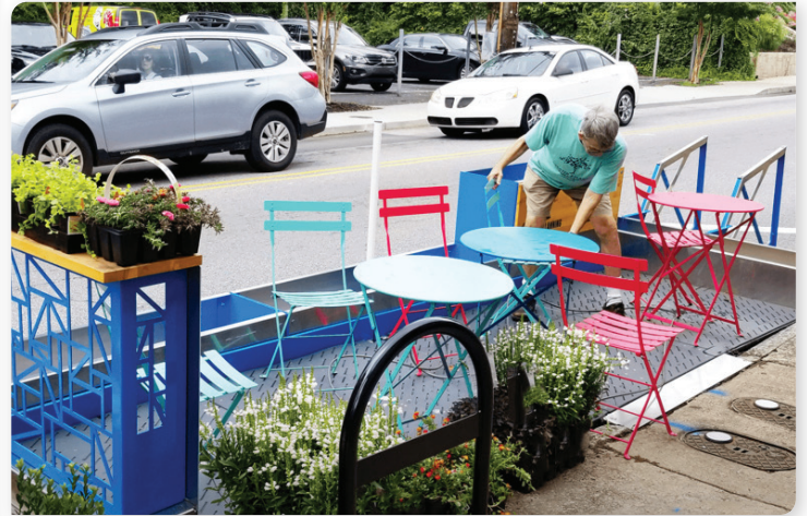
Shown above: an example of a parklet.

Just in time for Springtime al fresco dining! JenChan's won a Parklet Grant from the City of Atlanta. Parklets designed to last more than a couple of months typically cost anywhere from $20,000 to $50,000 or more. This grant is a game changer, allowing safe dining outside. It is temporary and designed to assist with the impact COVID-19 has had on restaurants without any outdoor dining option like a parking lot. The City will take back the parklet at the end of the year.