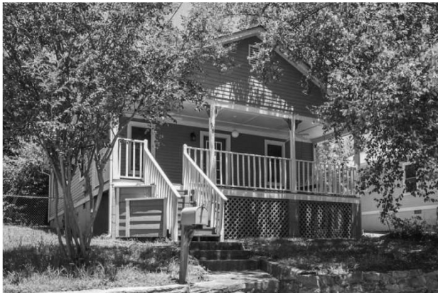
608 Gaskill Street SE | 3 Bd | 1 Ba