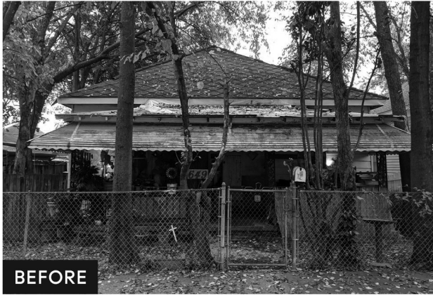
649 Gaskill Street SE | $350,000 | 2 Bd | 2 Ba