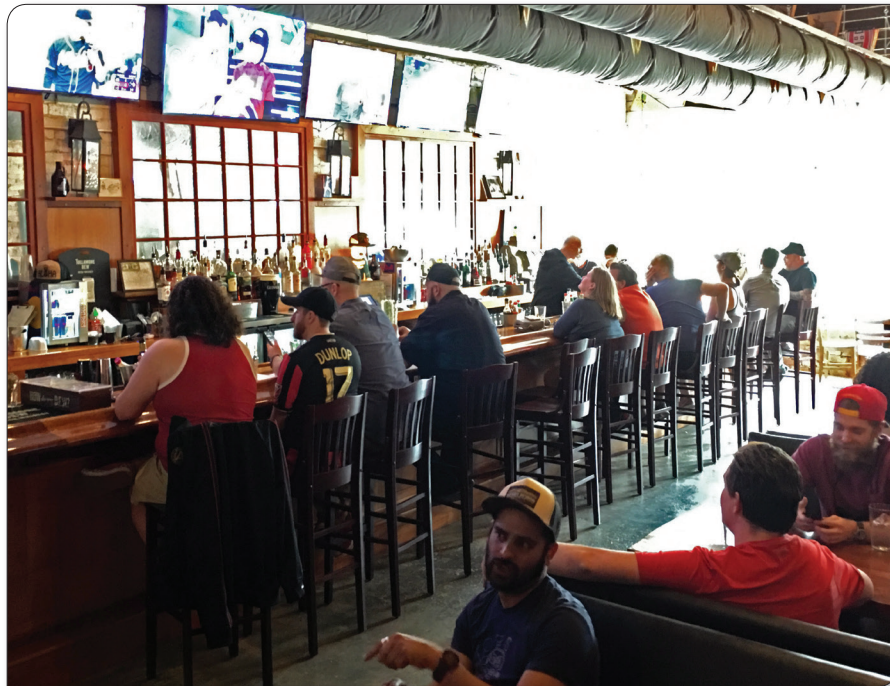
Manny's Grant Park. Near the corner of Boulevard and Woodward.