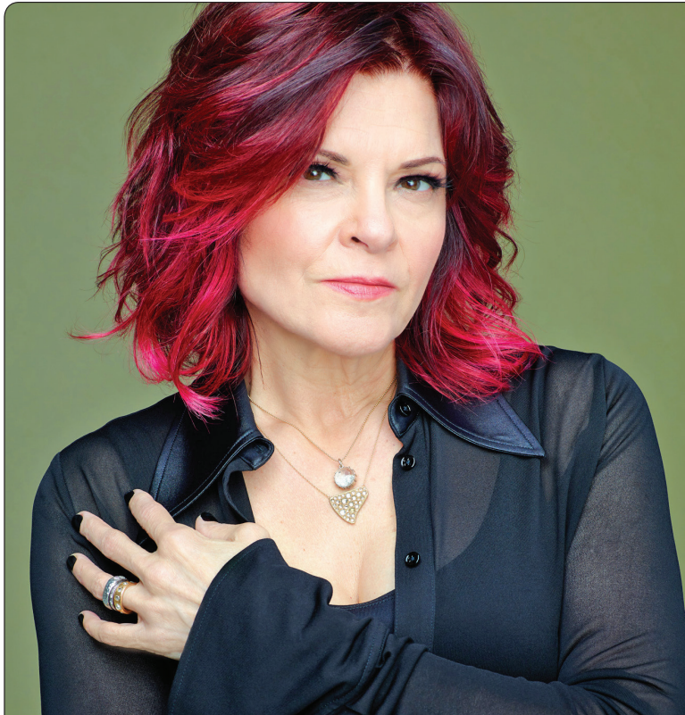
Saturday April 6 Rosanne Cash @ Center Stage

Saturday April 27 Johnny Marr @ Variety Playhouse – Had enough of Morrissey's whiney "no show" crap? Me too. Johnny Marr was the lead guitarist in The Smiths , has bounced around a plethora of new wave/college rock bands such as The Pretenders , and was voted Britain's Best guitarist of the last 30 years in 2010 by the BBC (not fake news). His unique style and sounds are pretty fantastic, and with a wealth of studio work and material to dive into, he makes sure the fans are satisfied. Who needs Morrissey? Not me.