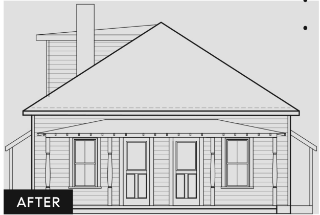
Coming Summer 2019 | 3 Bd | 3 Ba