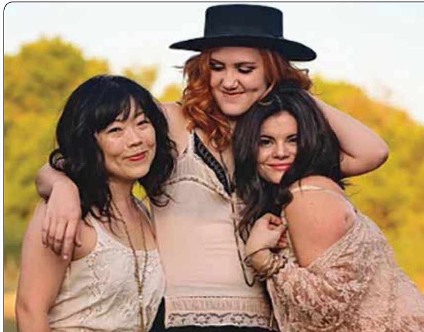
Sirens of South Austin @ Eddie's Attic, April 14 th.