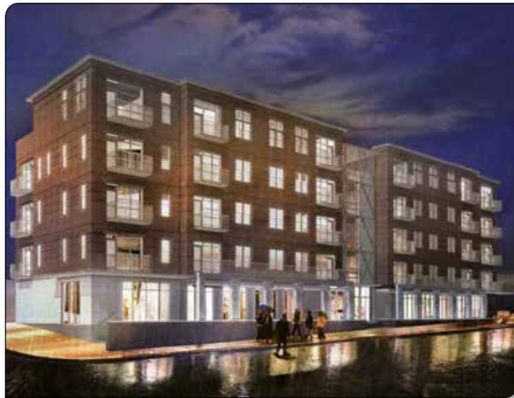
Architectural rendering of 765 Memorial

The project, 764 Memorial , is proposed for a long-scraggly site across the street from under-construction Atlanta Dairies . Now, the project's website reports that fifty percent of the building has been sold.