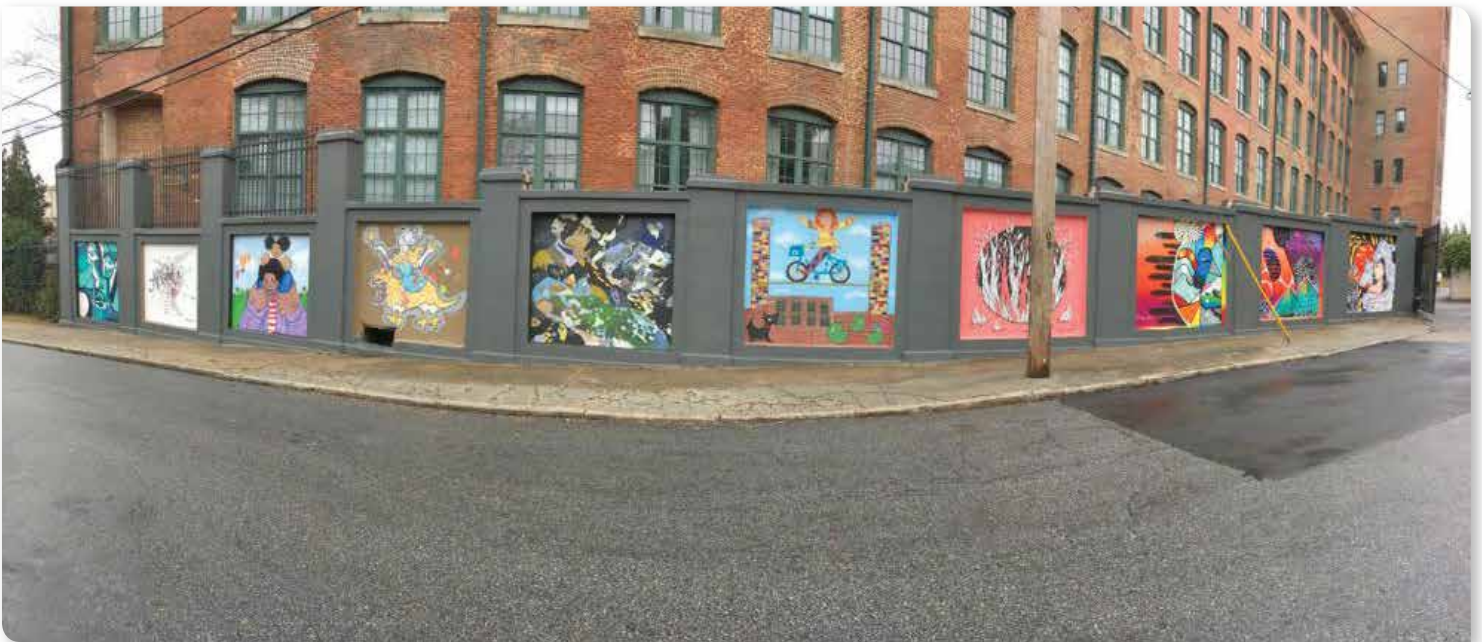
The Stacks Squares. Ready for round two. Located at the corner of Carroll Street and Tennelle